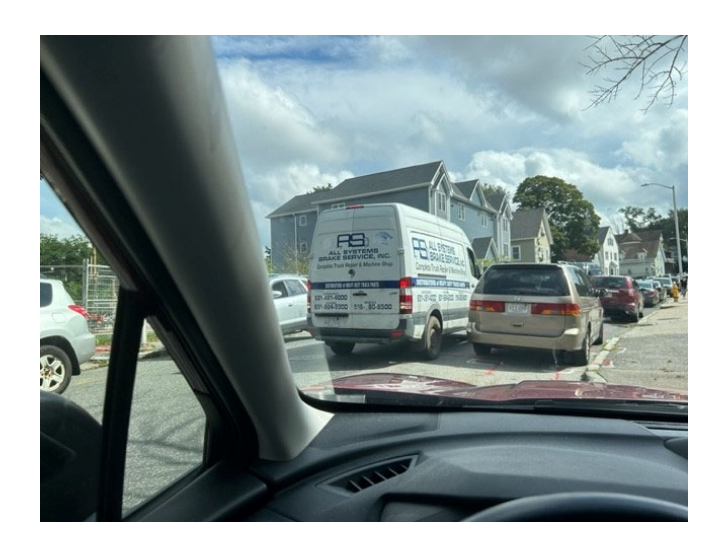
Image of the van that had to back down the street because it could not pass